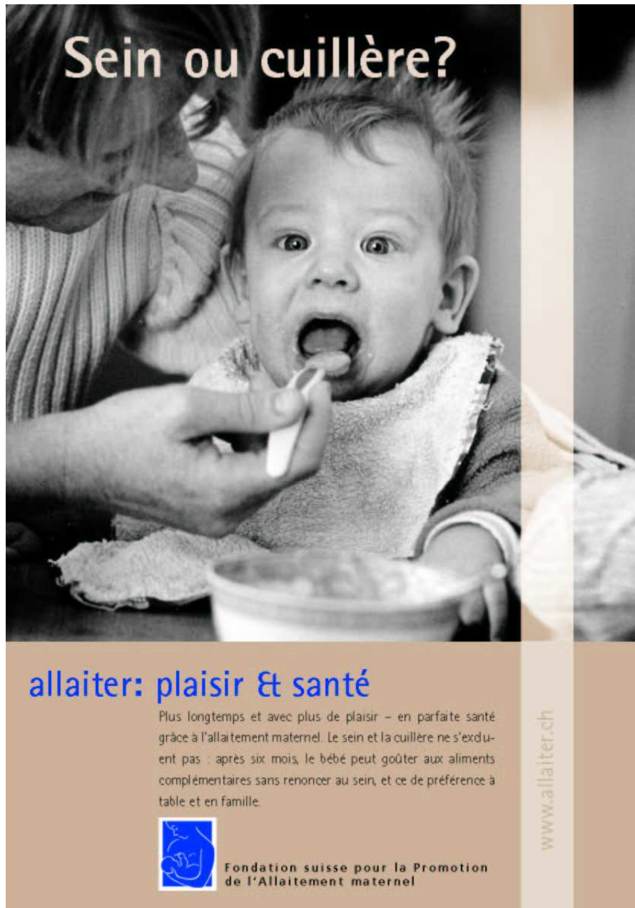
Post card Breastfeeding Week 2005: Breast or spoon? Breastfeeding: relishing and healthy